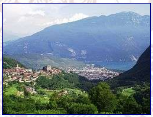
Location of Tenno