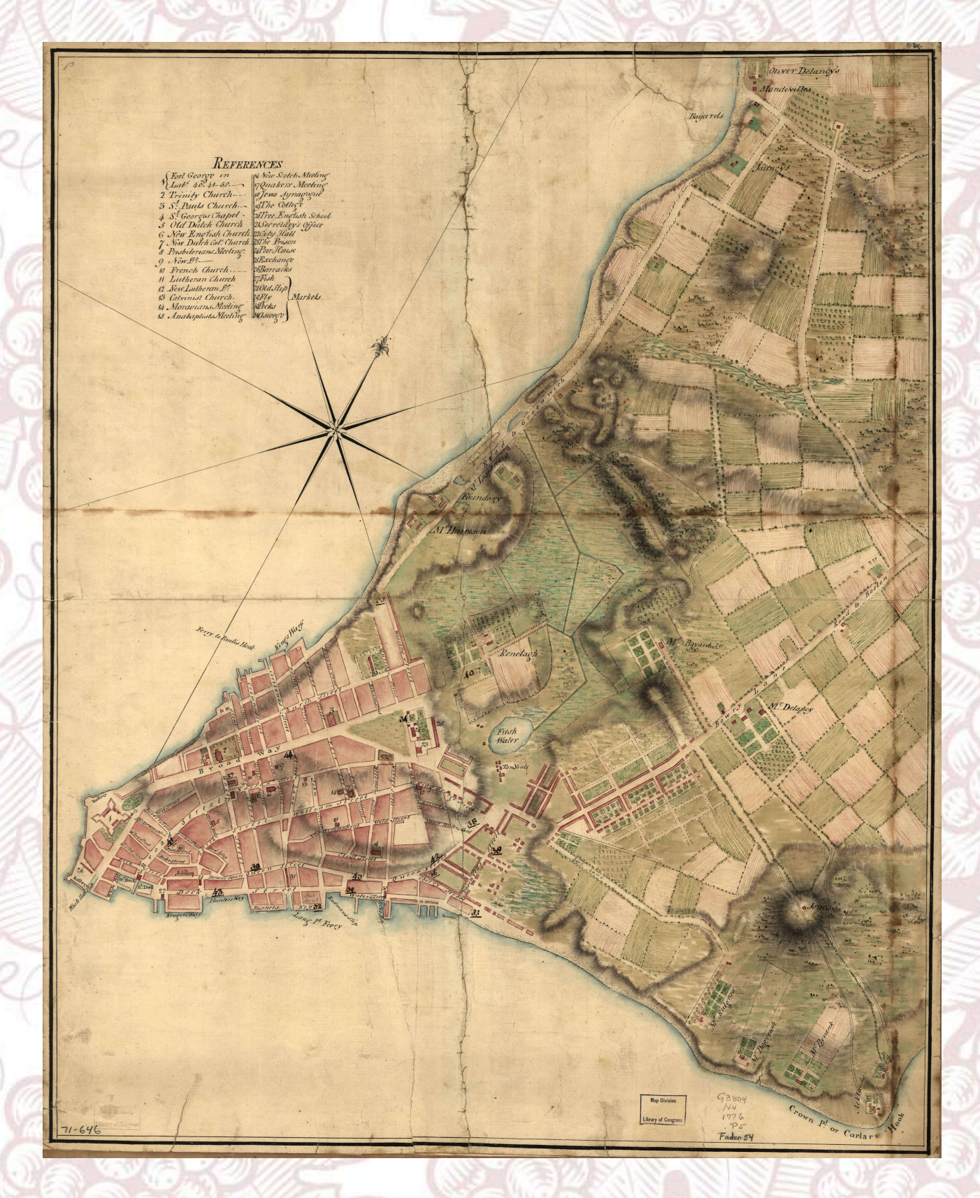
(A PLAN OF THE CITY OF NEW YORK. LOC GM71000646.TIF