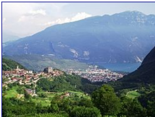
Location of Tenno