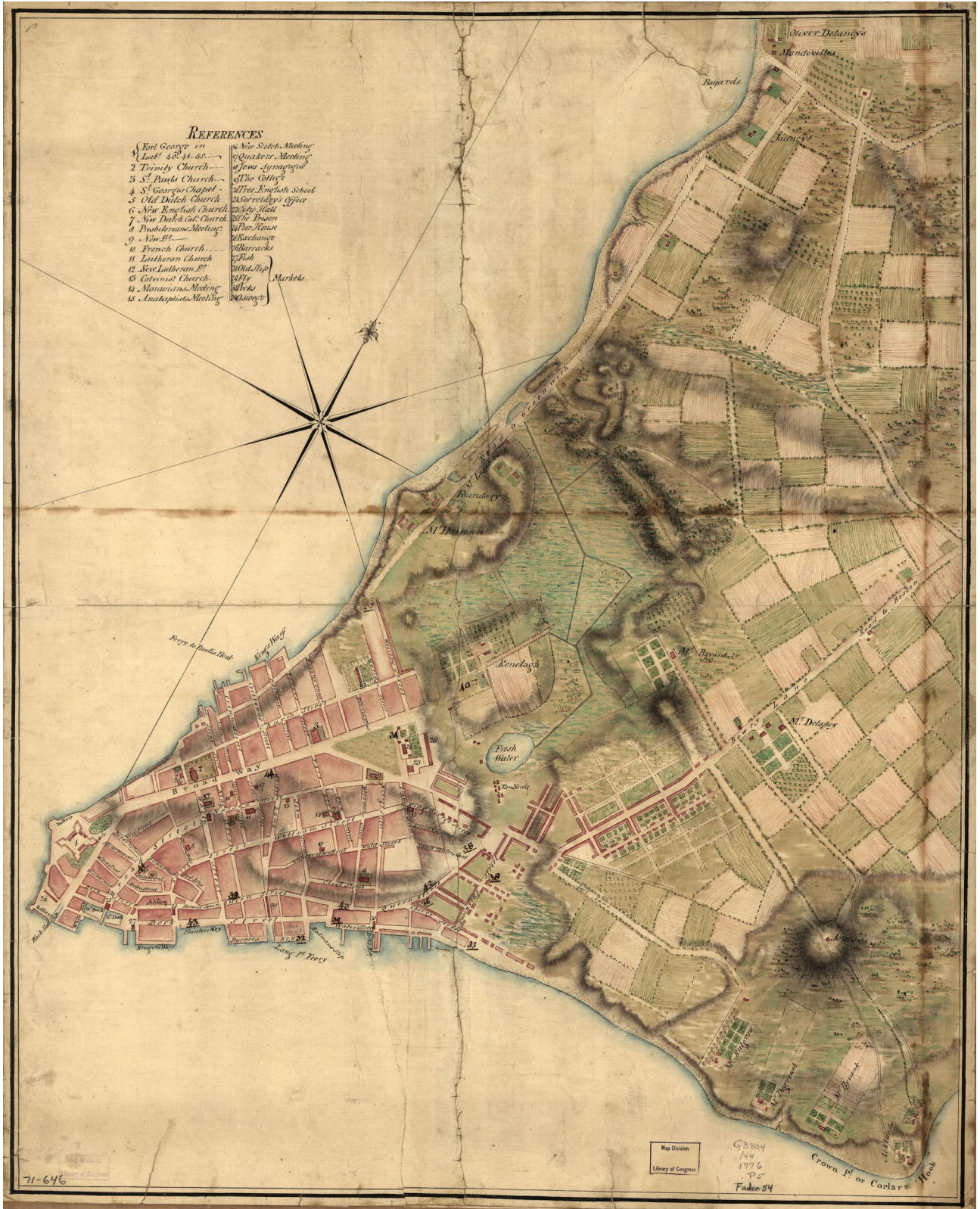
(A PLAN OF THE CITY OF NEW YORK. LOC GM71000646.TIF