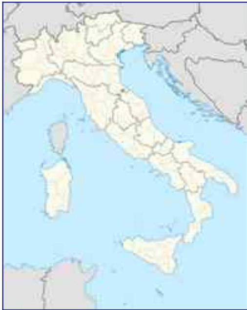
Tenno Location of Tenno in Italy