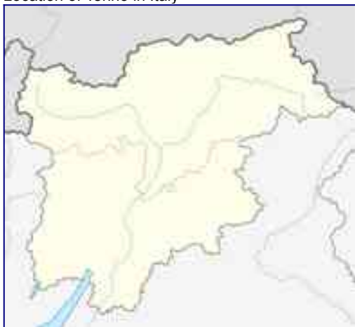
Tenno Tenno (Trentino-Alto Adige/Südtirol) Coordinates: 45°55'N 10°50'E

Country Italy Region Trentino-Alto Adige/Südtirol Province Trentino (TN) Frazioni Gavazzo, Cologna, Ville del Monte,