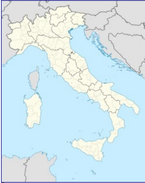
Tenno Location of Tenno in Italy