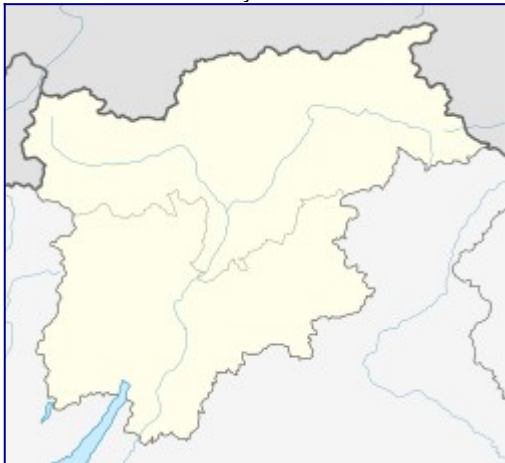
Tenno Tenno (Trentino-Alto Adige/Südtirol) Coordinates: 45°55'N 10°50'E