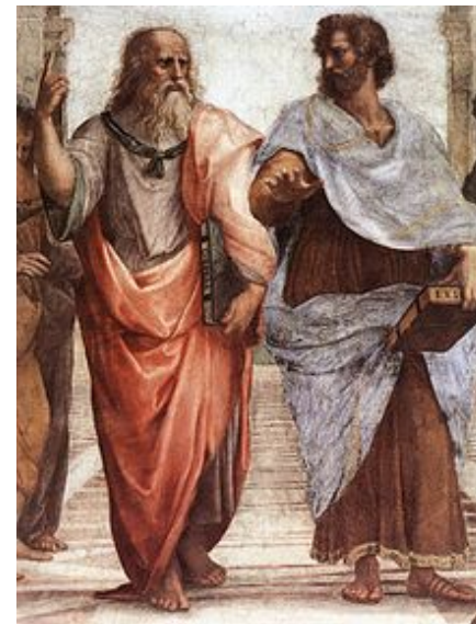
Plato and Aristotle The School of Athens by Raphael 'As above, so below'

The unfolding financial crisis is a hall of mirrors. What appears a terrible thing may hide what is good. Only a vision as broad as Christ, One with Our Father in Heaven can help us see through the fog of financial war. Never has maya been woven so thick around the affairs of men.